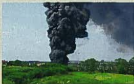
Fire or explosion