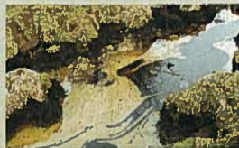
Rainbow sheen on water