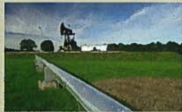
Dead vegetation in a green area