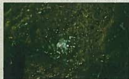
Mud or water bubbling up