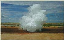
White vapor cloud