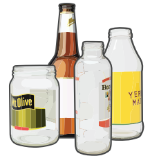
Glass Bottles and Jars (empty and dry)

Glass no glass accepted curbside in City of Ypsilanti