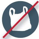
No Plastic Grocery Bags, Film, or Wrap (return to retail)