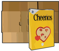
Cardboard and Paperboard (empty and flatten)