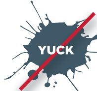
No Food or Liquid (empty all containers)