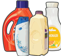
Plastic Bottles, Jars, and Jugs (empty, rinse and replace cap)

Glass no glass accepted curbside in City of Ypsilanti