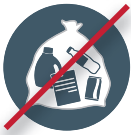
Do Not Bag Recyclables (no garbage)