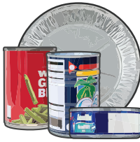
Aluminum and Steel Cans (empty and rinse)