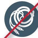
No Tangles (no hoses, wires, chains, or electronics)