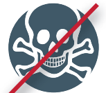
No Hazardous Waste