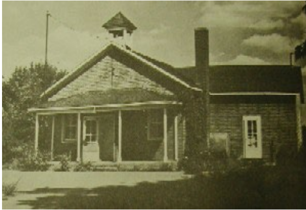
Roberts School in 1953

Location: Removed from the southeast corner of Carpenter and U.S. 12.